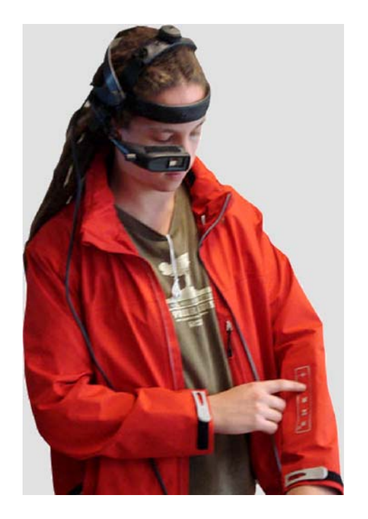
Fig. 2. User interacting with the i-jacket

500 monocular see-through head-mounted display (HMD) and an ultra-mobile PC (UMPC, Sony Vaio UX70) as shown in Fig. 2. The decision of using MR instead of augmented-reality (AR) has been motivated by the relatively poor results yet achieved in the field of mobile indoor tracking. Indeed, techniques like pedestrian dead reckoning (PDR) [2] or Bayesian localization framework using WiFi signals [6] does not give satisfying enough results to ensure the registration process needed for convincing AR.