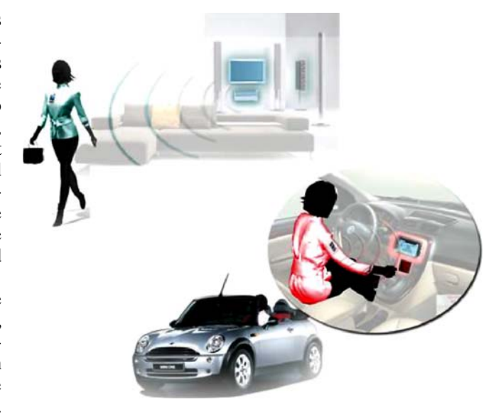
Fig. 1. Visionary scenario

Chloe prepares herself to go out while listening to her preferred music. She transmits orally her program of the day as well as her itinerary to her electronic agenda, which is somewhere in the house. At the time of leaving, she puts on her INTERMEDIA jacket. At this moment, all the data of each multimedia device are transmitted automatically to her jacket (e.g., the itinerary which she intends to follow this morning and her music selection, see Fig. 1). Chloe gets into her car. The information contained in the jacket is transferred to the electronic device in the car: the car radio