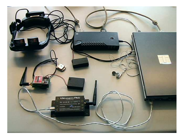
Figure 1: Required equipment for a typical wearable Augmented Reality framework: a notebook, a stereographic seethrough HMD, a GPS antenna, some battery packs.

In [VKT*02], Vlahakis and al. used again a similar backworn Augmented Reality platform to mix artificial ancient buildings with reality in an outdoor archaeological site. Nevertheless, they also implemented a handheld device alternative to their encumbering classic framework. They used a PDA with a position tracker (but not orientation) to check when the user entered within a perimeter around an interest point. Some information (like pre-rendered Augmented Reality images or videos) were then sent to the mobile device through a wireless internet connection. This approach