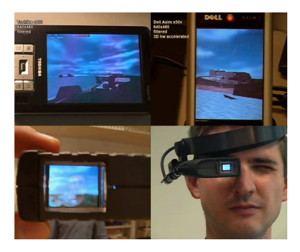
Figure 3: Test scene rendered in realtime on the e800 and x50v embedded screen and on the head-worn display.

frustrating drawback: enabling an external display disables onboard graphic hardware acceleration, so we had to use the software-mode OpenGL ES implementation in this case, too, thus degrading performances. Moreover, OpenGL ES specifications do not allow to directly access the draw-buffer: we had to call the slow glReadPixels function once per frame, in order to get a copy of the rendered image. glReadPixels under OpenGL ES allows only to retrieve images in 32 bit RGBA format, wasting unnecessary resources and requiring a second conversion to a 16 bit format working with the VGA external adapter. Finally, Liteye-500 accepted only 800x600-sized streams, requiring an additional bitmap scale. We extremely optimized the code we used for this purpose: nevertheless, the biggest bottleneck was the glReadPixels which is unavoidable. All these limitations halved our framerate when connected to the see-through head-mounted display.