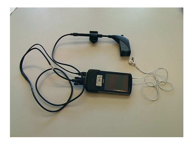
Figure 2: Our lightweight platform: Toshiba e800 PDA, Liteye-500, headphones.

In this section we present our wearable Mixed Reality framework: firstly, we show a conceptual overview of the entire system architecture; secondly, we deepen into more technical details about every aspect of our platform.